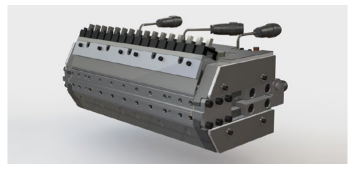
Flex Lip Slot Die