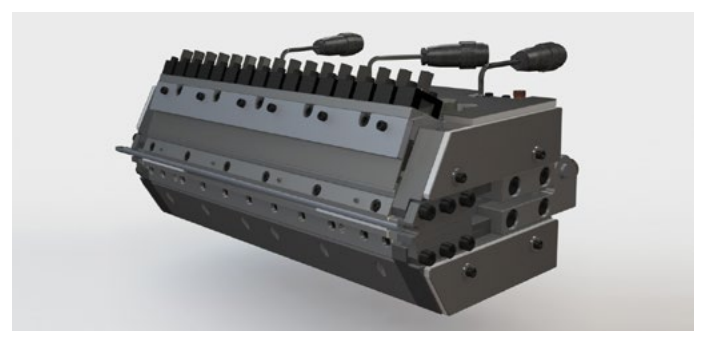
Rotary Rod with Flex Lip Slot Die