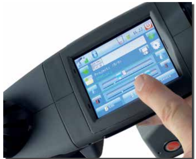
Control and input via touchscreen

Prints true type emulation on plastic with black acetone ink