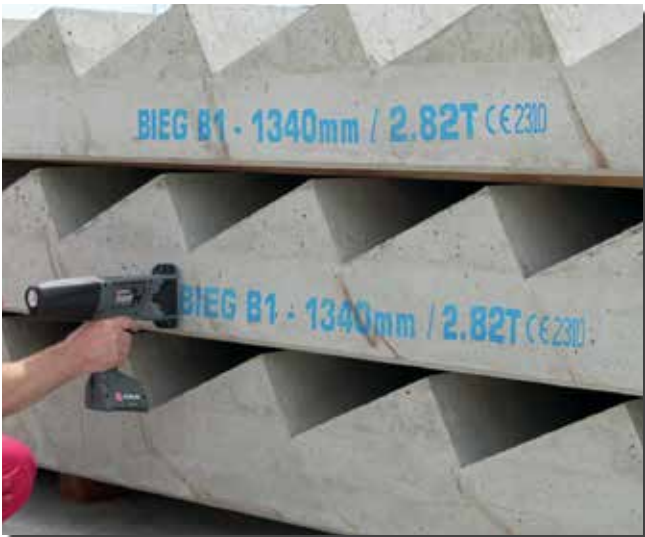
Prints on concrete with blue pigmented ink