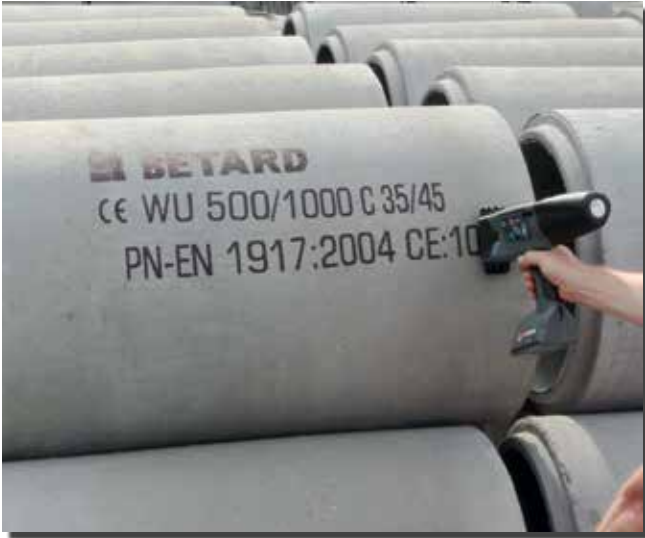
Prints on concrete with special UV-resistant black ink

These, and different texts, logos and pictograms have unlimited space in the 2 GB large memory (>50,000 Texts à 10,000 characters).