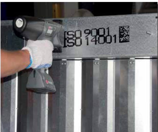
Prints on steel - 2D barcode - with black universal ink