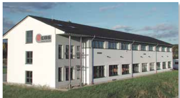
Head Office, Nuembrecht, Germany

We would be pleased to welcome you as our new customer!