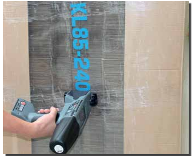
Prints on stretch wrap with pigmented ink

A multitude of practical accessories and additional functions, for example; printing stabilizers, special wheels, bags, scanners, to name but a few, will be available soon.